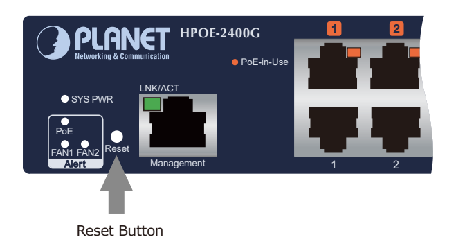
Figure 4-4: HPOE-2400G Reset Button