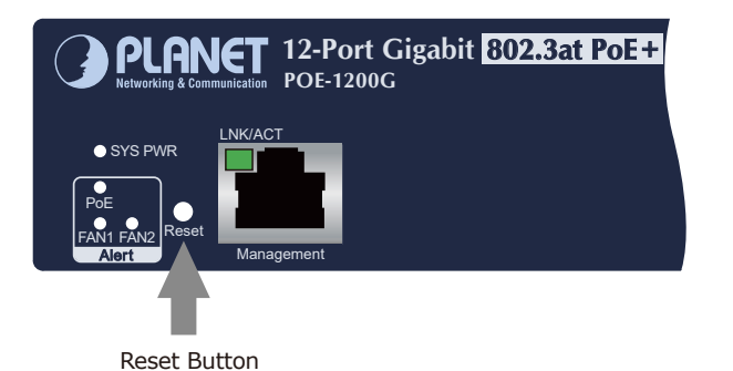
Figure 4-1: POE-1200G Reset Button

To reset the IP address to the default IP address "192.168.0.100" or reset the login password to default value, press the hardware-based reset button on the front panel for about 10 seconds. After the device is rebooted, you can log in the management Web interface within the same subnet of 192.168.0.xxx.