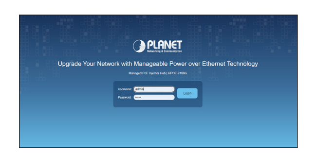
Figure 3-2: Web Login Screen

The following screen is based on the HPOE-2400G. For the POE-1200G/POE-2400G/HPOE-1200G, the web screen is the same as that of the HPOE-2400G.