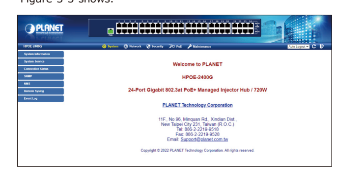
Figure 3-3: Web Main Screen of PoE+ Managed Injector Hub

3. After entering the password, the main screen appears as Figure 3-3 shows.