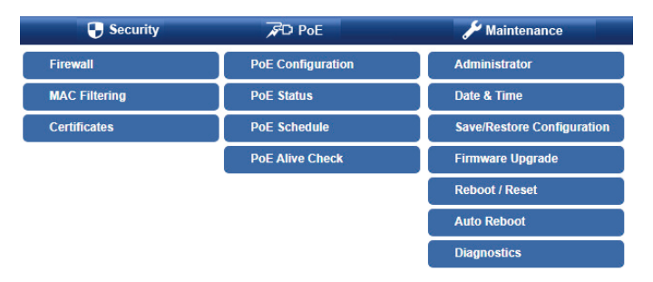
Figure 3-5: PoE+ Managed Injector Hub Menu

Now, you can use the Web management interface to continue the PoE+ Managed Injector Hub management.